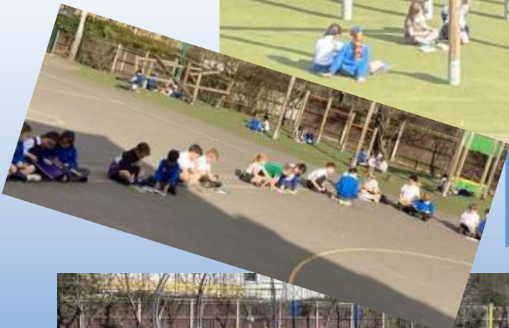
Year 4 & 2 reading together in the sunshine.