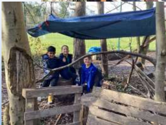
Den building (just in time for the hail to arrive)