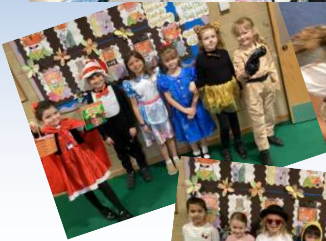
Year 2 dressed as their favourite characters—can you guess who?