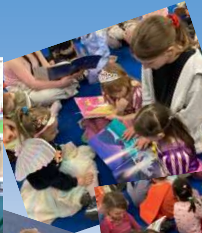
Year 6 happily reading with Reception.