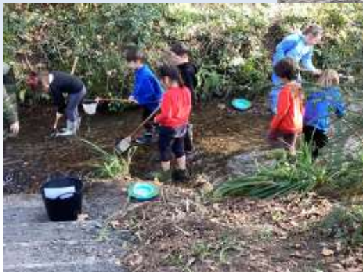
Pond dipping and Geography field work to find out the speed at the river at different points.